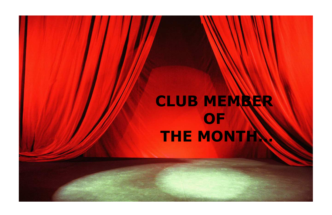
WILL RETURN NEXT MONTH...